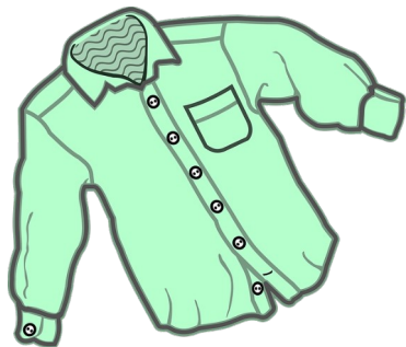
SHIRT - shirt