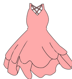
DRESS - dress