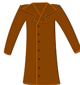
COAT - coat