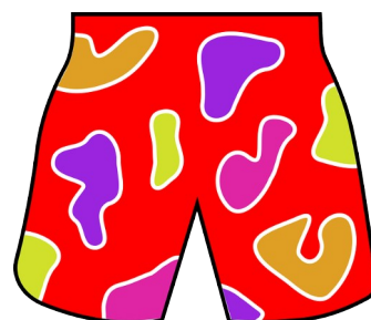
SHORTS - shorts