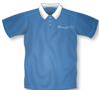
POLO - polo