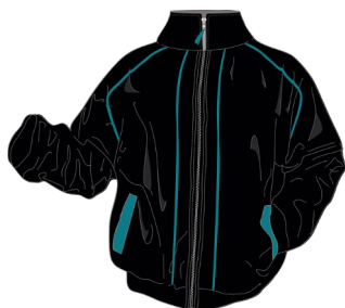
RAINCOAT - raincoat