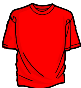
T-SHIRT - t-shirt