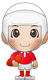
RUGBY - rugby