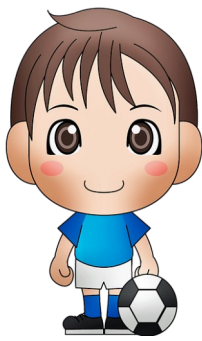
SOCCER - soccer