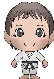
MARTIAL ARTS - martial arts