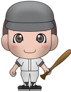
BASEBALL - baseball