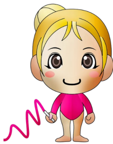
GYMNASTIC - gymnastic