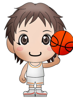
BASKETBALL - basketball