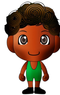
ATHLETIC - athletic