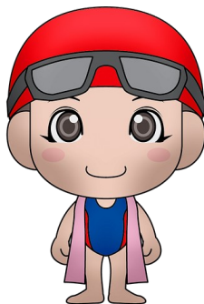
SWIMMING - swimming