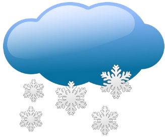
SNOW - snow