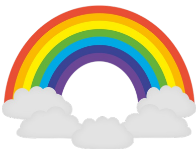
RAINBOW - rainbow