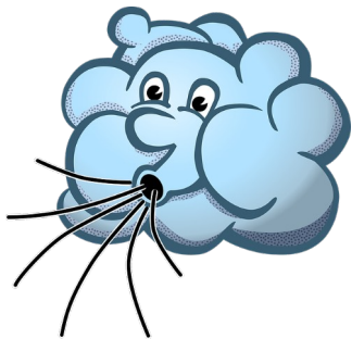
WIND - wind