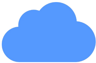
CLOUD - cloud