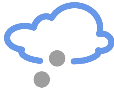
HAIL - hail