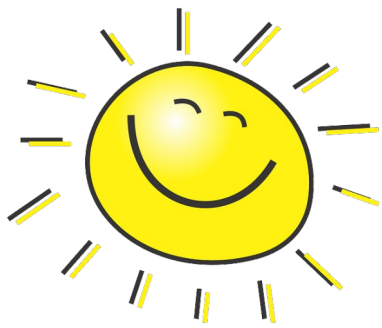
SUN - sun