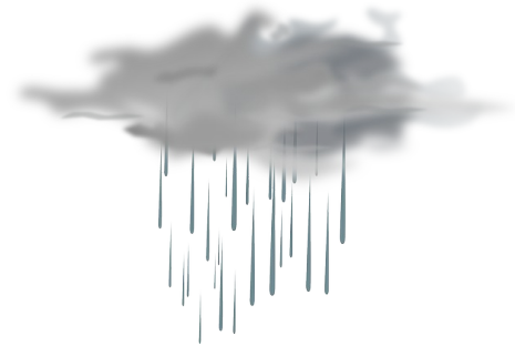
RAIN - rain